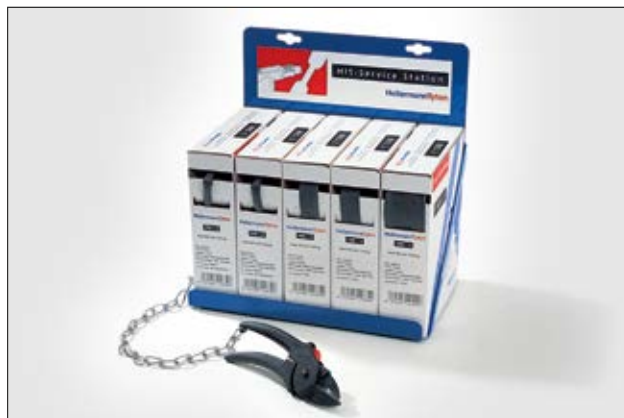
HIS-Service Station contains 5 dispensers and a special cutter.