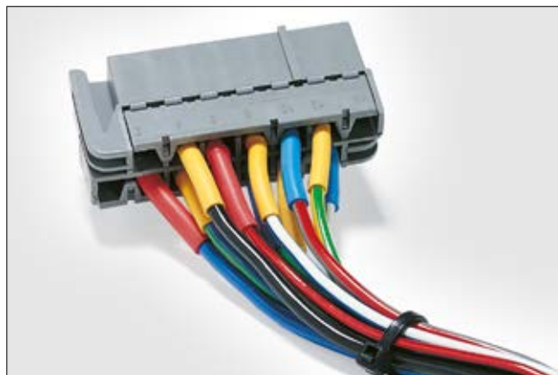
HFT-A conforms to major standards (VG) used in all Defence industries.